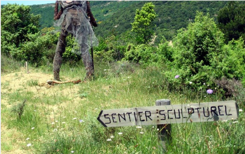
Old man Traveler - ARTISTE Joe big big