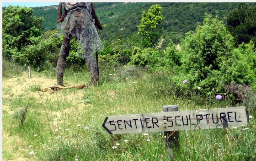
Old man Traveler - ARTISTE Joe big big - © Klaus Neundorf