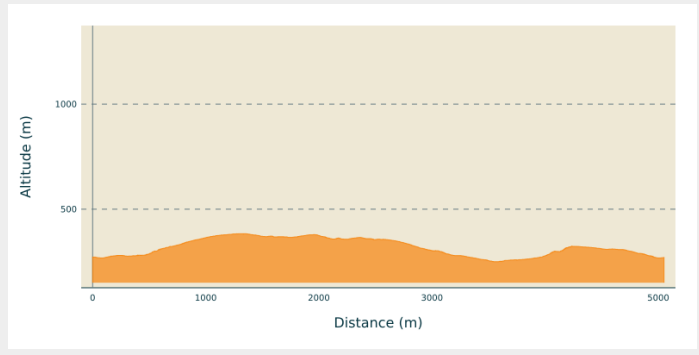
Min elevation 250 m Max elevation 383 m