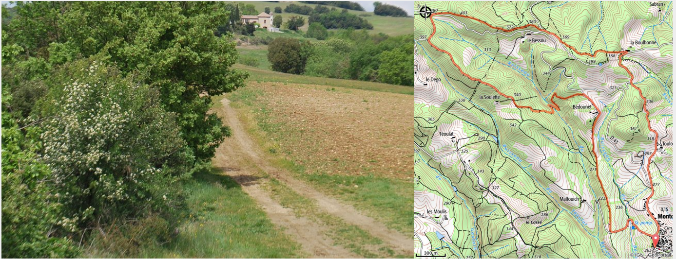
Panorama sentier (DMX)

Sporty excursion where you will alternate between some rough climbs and pleasant passages in the woods at the shade of the oaks. The trail offers a multitude of landscapes: views of the vineyards, scrubland, hills, Pyrenees... Also enjoy the presence or traces of certain raptors and wild boars.