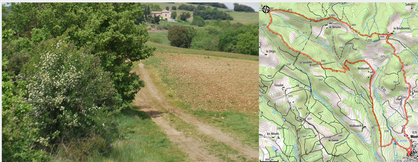
Panorama sentier (DMX)

Sporty excursion where you will alternate between some rough climbs and pleasant passages in the woods at the shade of the oaks. The trail offers a multitude of landscapes: views of the vineyards, scrubland, hills, Pyrenees... Also enjoy the presence or traces of certain raptors and wild boars.