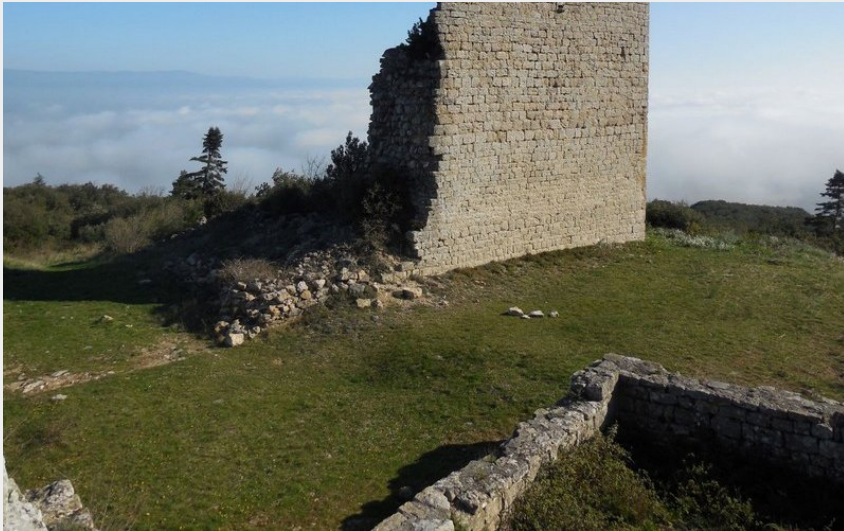
Ruines de Miramont