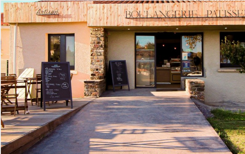
Attribution : Conques Le Fournil de l'Orbiel Façade