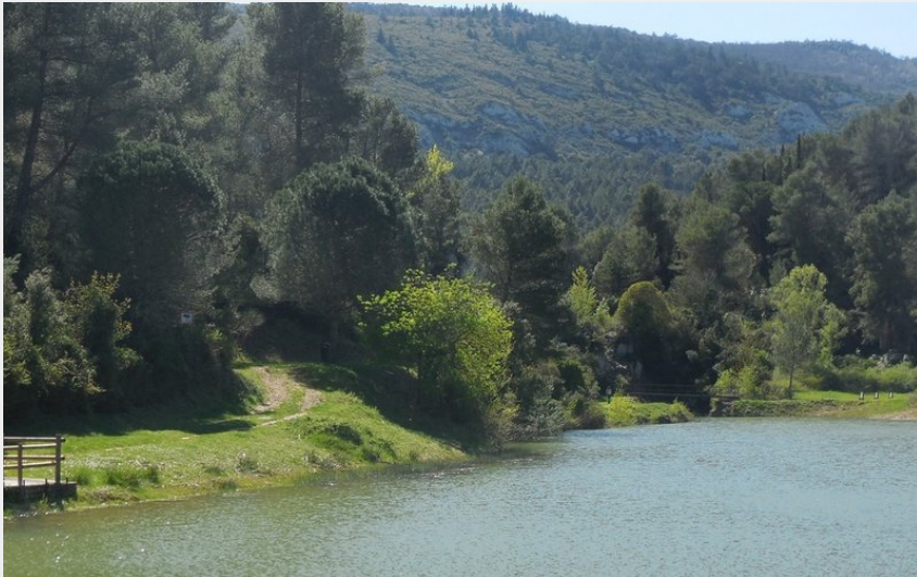
Attribution : Barbaïra Lac La Fount de Mounel