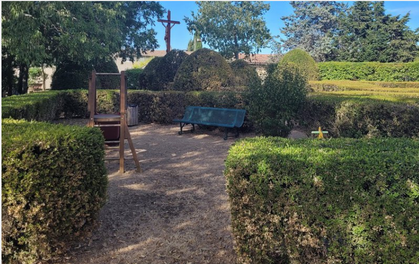
Attribution : jardin à la française - CAUX ET S_