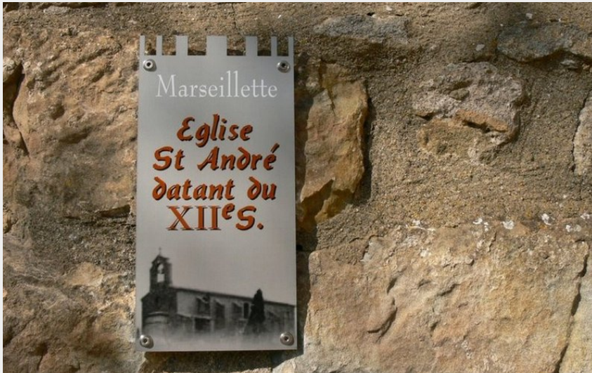
Attribution : Eglise Marseillette