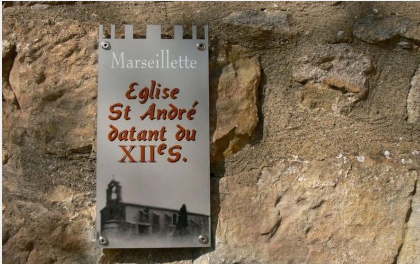
Attribution : Eglise Marseillette