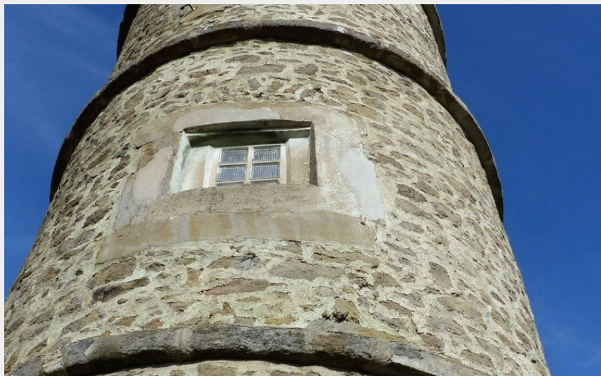
Attribution : Tour Chappe Marseillette (1)