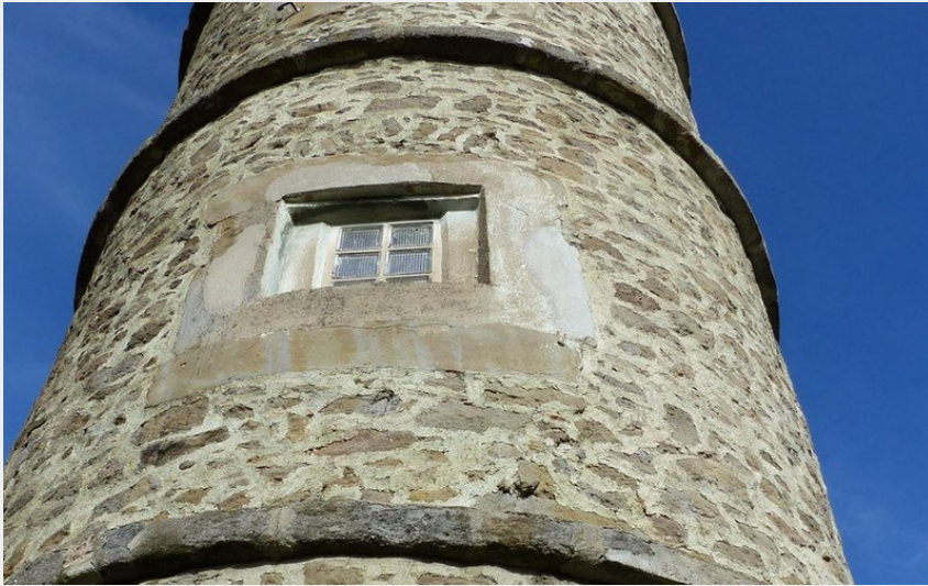
Attribution : Tour Chappe Marseille (1)