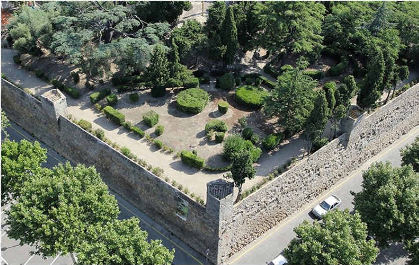
Attribution : 6_09 (Patrimoines en Occitanie)