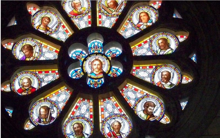
Attribution : Arzens église deux