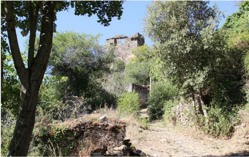
Attribution : Château Citou (1)