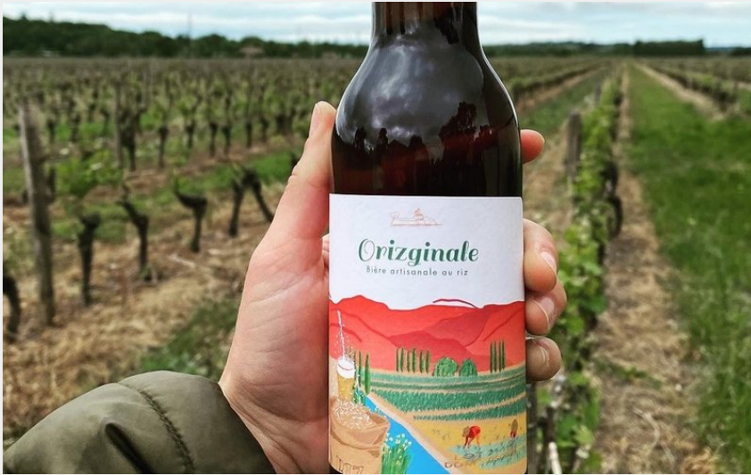
Attribution : Marseillette bière