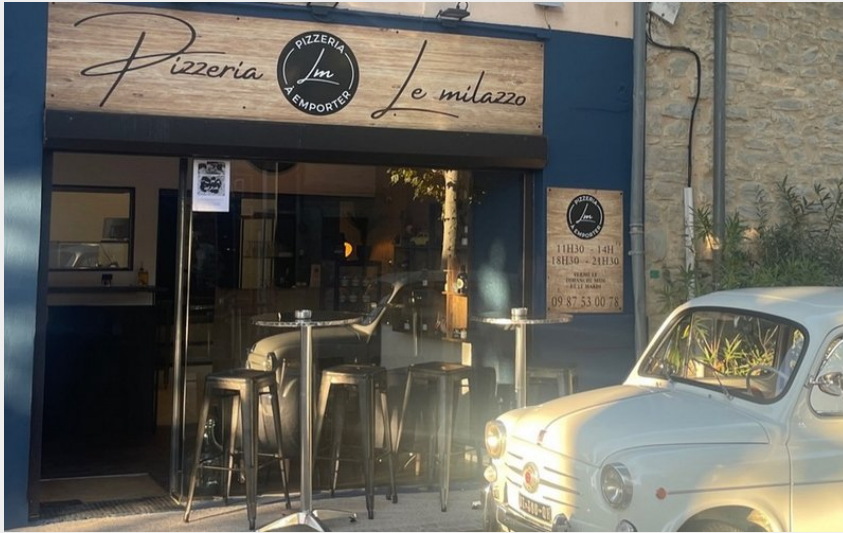
Attribution : LE MILAZZO EXT