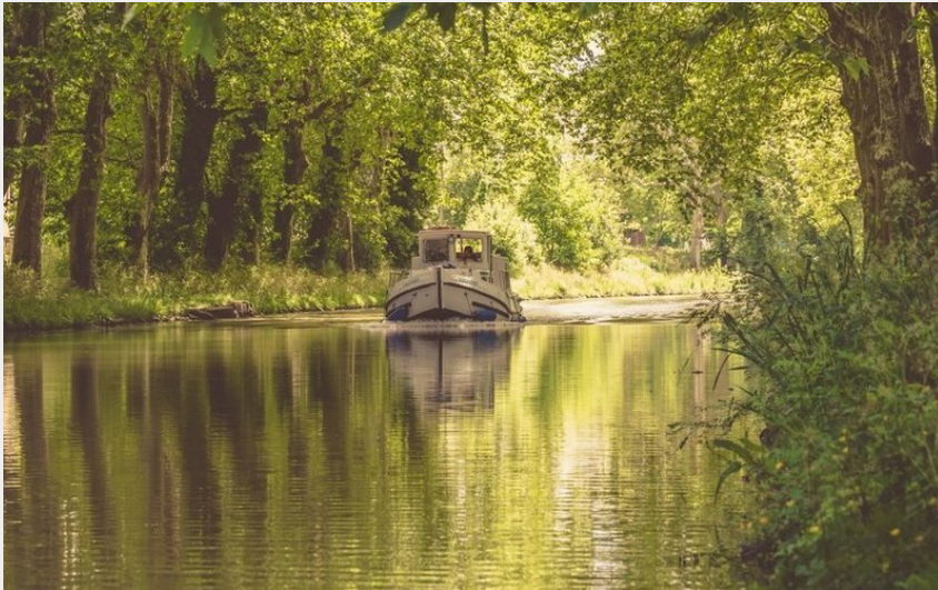
Attribution : canal du midi carcassonne (OTC GRAND CARCASSONNE)