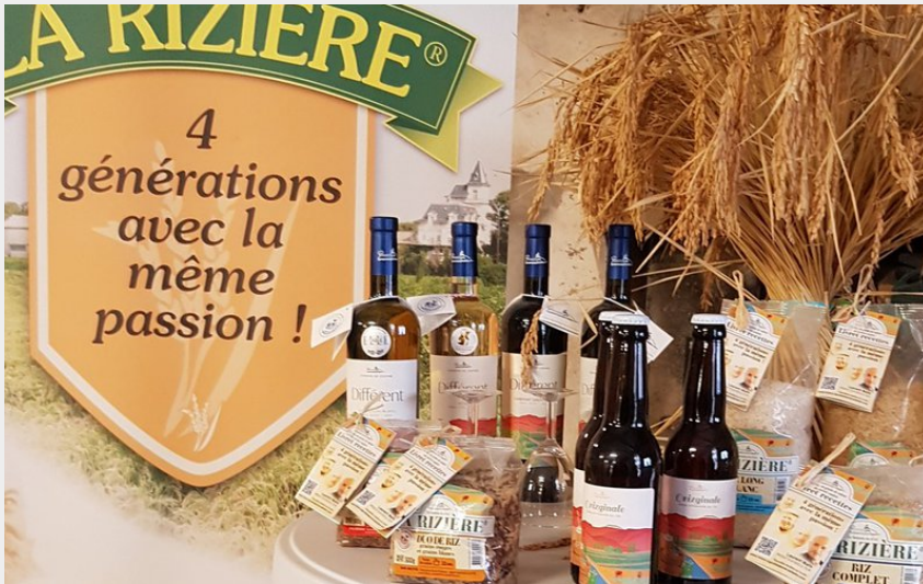
Attribution : Marseillette Rizière Malis (1)