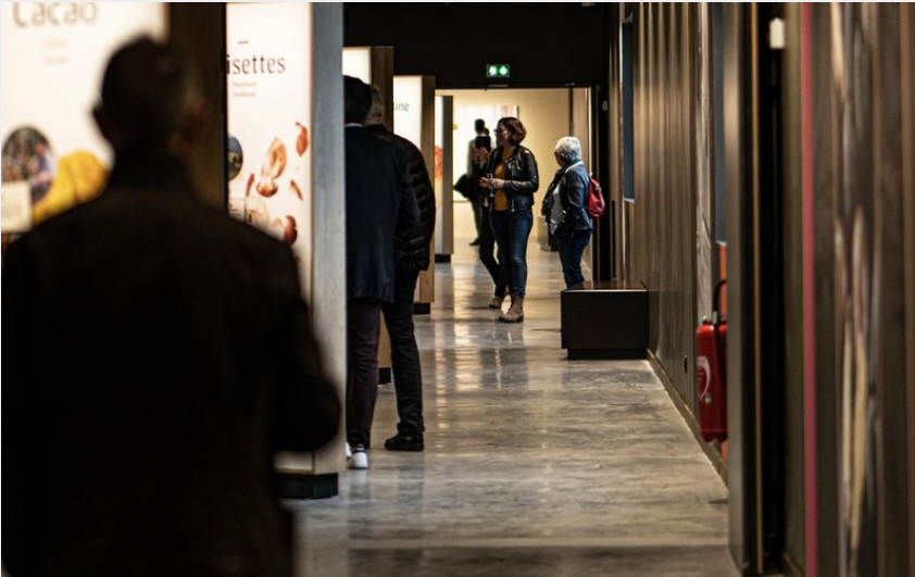
Attribution : Nougallet ateliers 1200