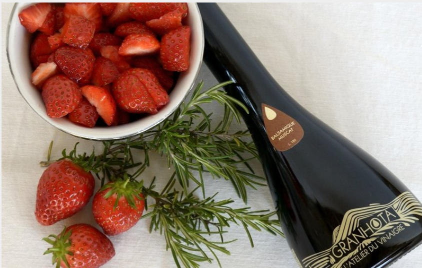
Attribution : b muscat 2 (Granhota)