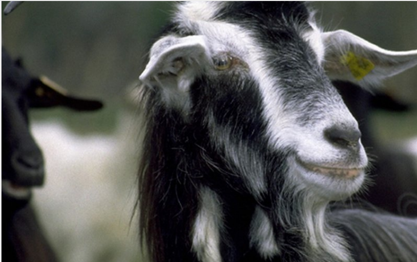
Attribution : LA VILATTE PORTRAIT