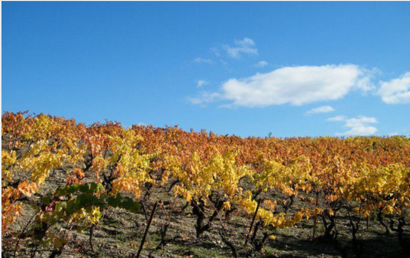
Attribution : Domaine Sainte Marie des Pins (1)