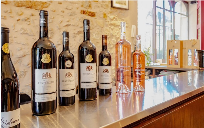
Attribution : CHATEAU FONTENELLES CAVEAU