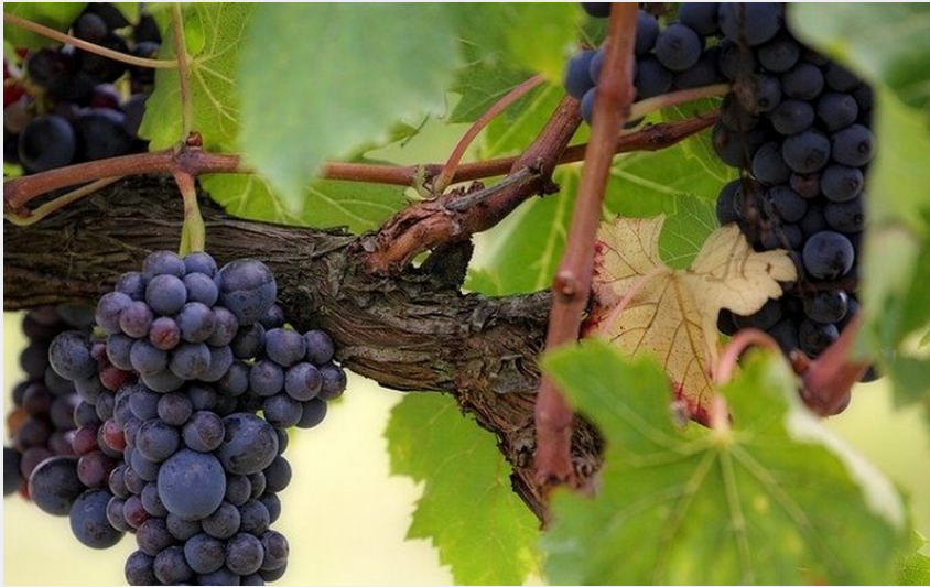
Attribution : GRAPPE RAISIN