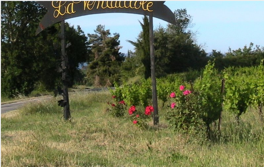
Attribution : DOMAINE LA VENTAILLOLE (1)