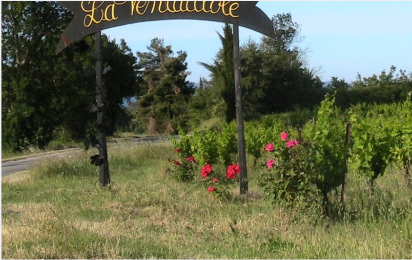
Attribution : DOMAINE LA VENTAILLOLE (1)