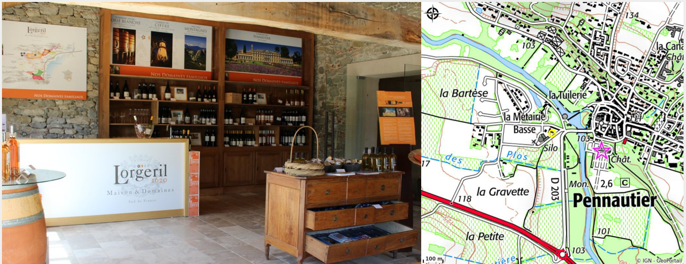
Attribution : LA CAVE DU CHATEAU DE PENNAUTIER (CHATEAU DE PENNAUTIER)