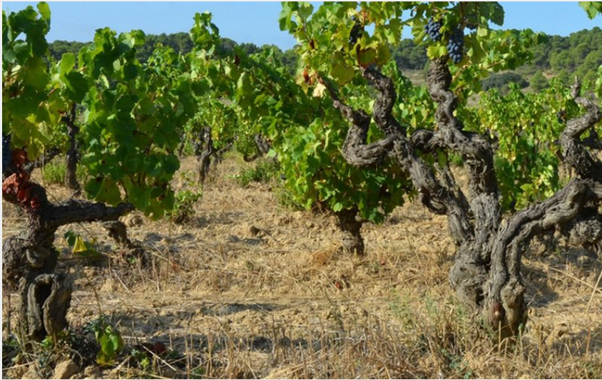
Attribution : TBoisée-190918_40