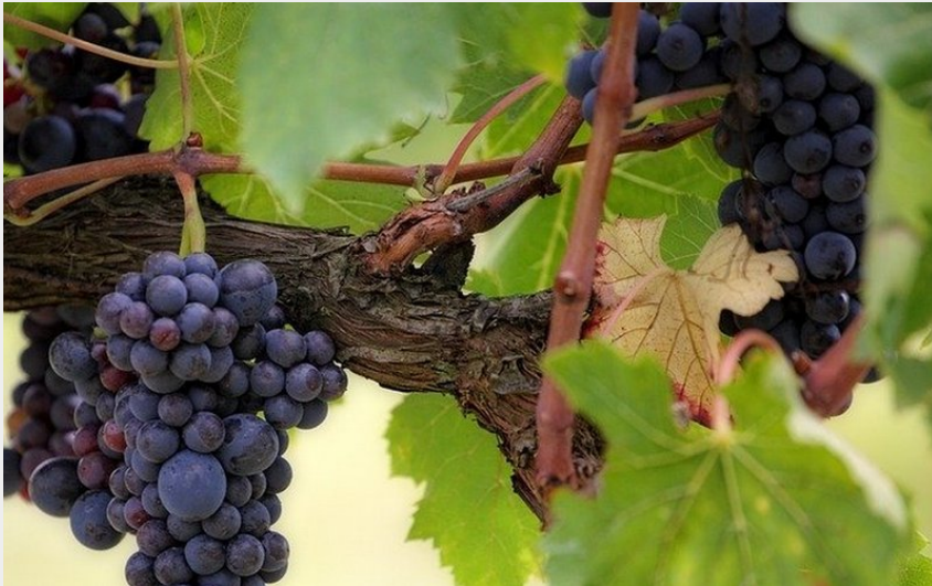
Attribution : GRAPPE RAISIN