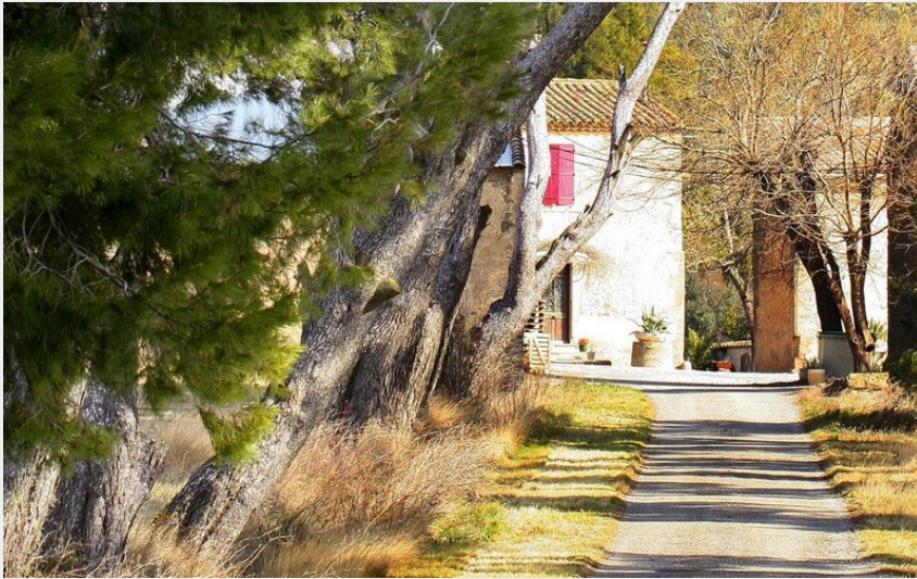
Attribution : CHATEAU-FABAS2