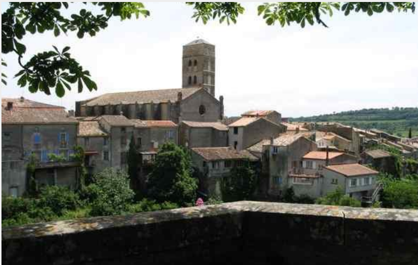
Attribution : Montoliou (1)