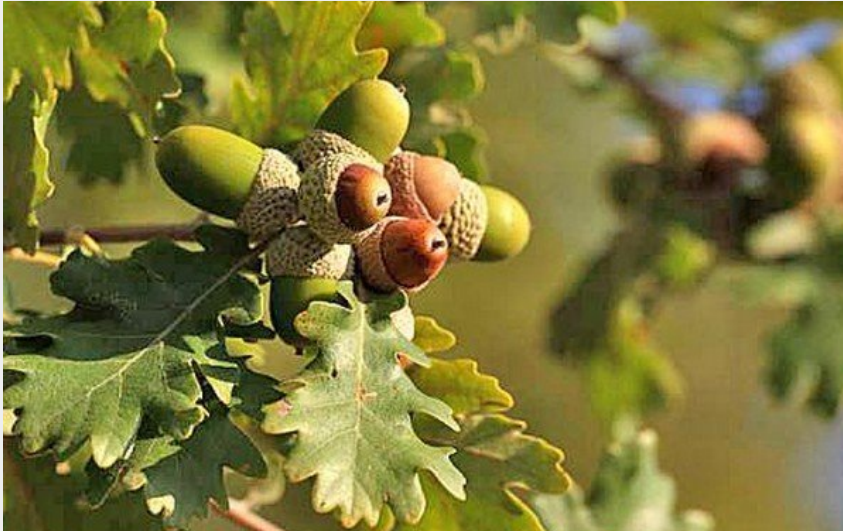
Attribution : CONSERVATOIRE trufficole Moussoulens Chêne