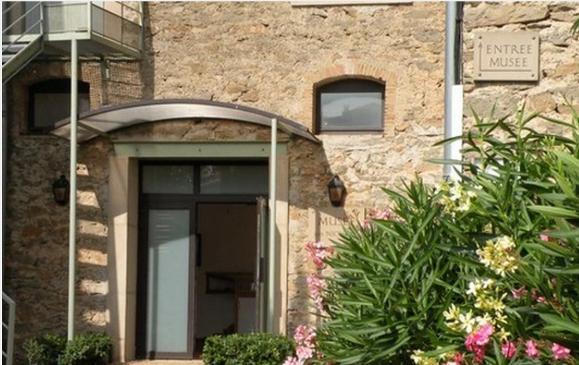
Attribution : MUSEE RUSTIQUES