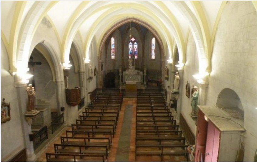
Attribution : EGLISE-RUSTIQUES