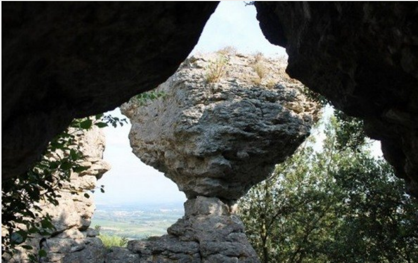
Attribution : les benitiers de floure