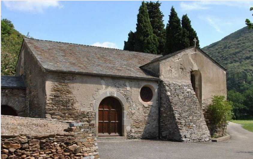
Attribution : chapelle st jean de citou1