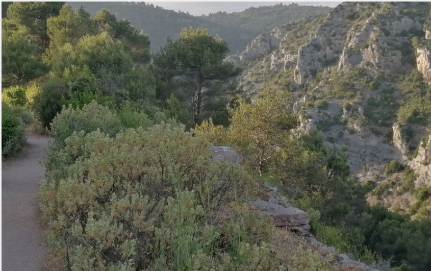
Attribution : CAUNES CARRIERE DU ROY (1)