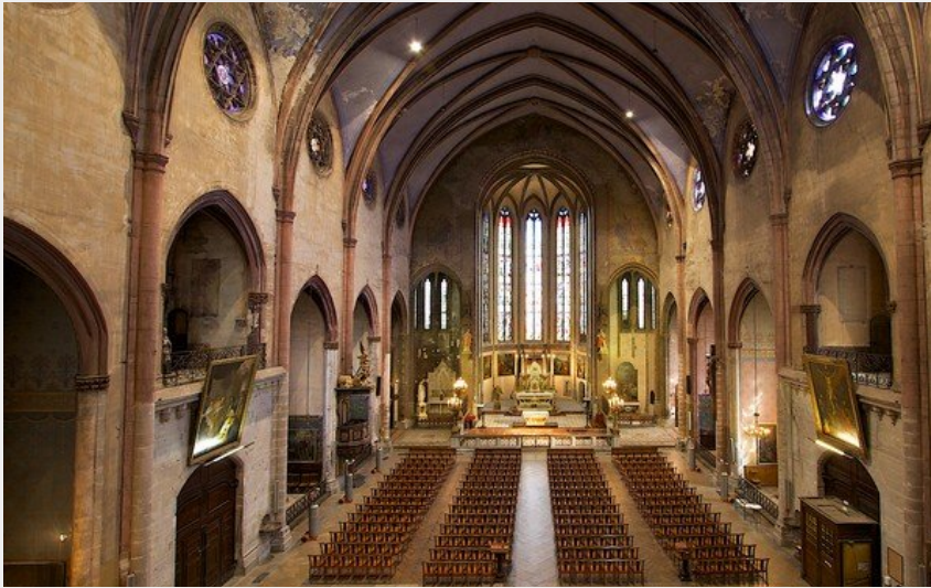
Attribution : EGLISE SAINT VINCENT