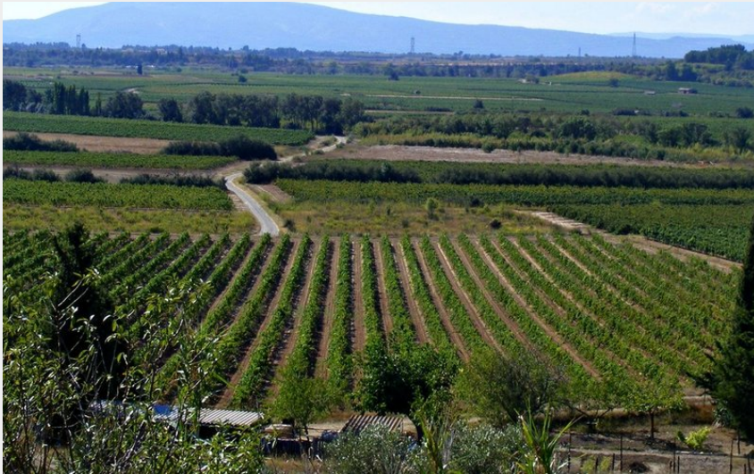
Attribution : Vue etang marseillette-2015