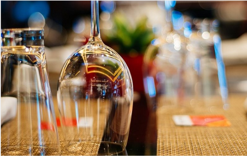
Attribution : Verre table restaurant