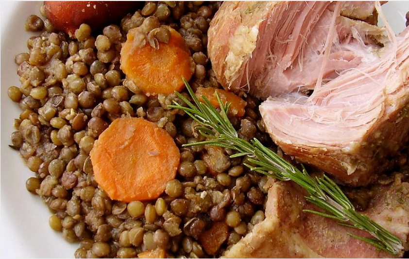
Attribution : L'OUSTAL